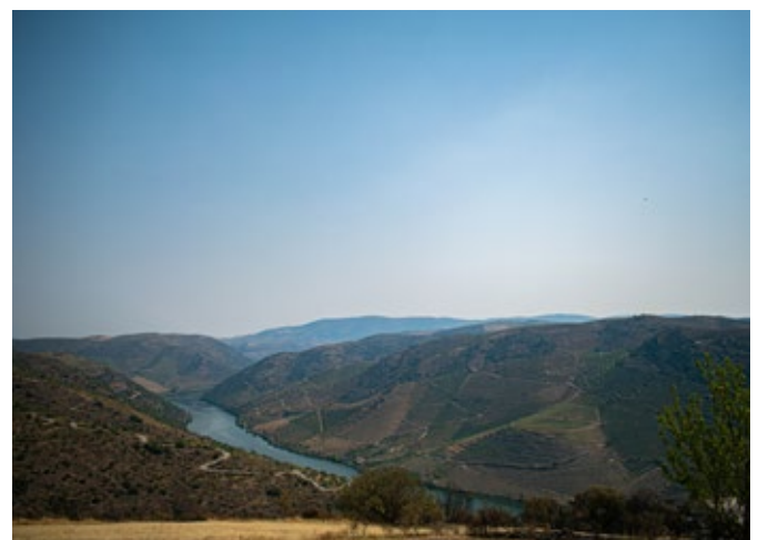
Pic 1: The Côa Valley Archaeological Park.