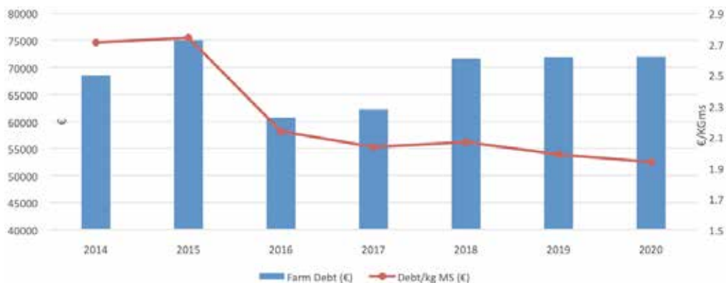
Figure 1. Farm debt and debt per kg milk solids sold.