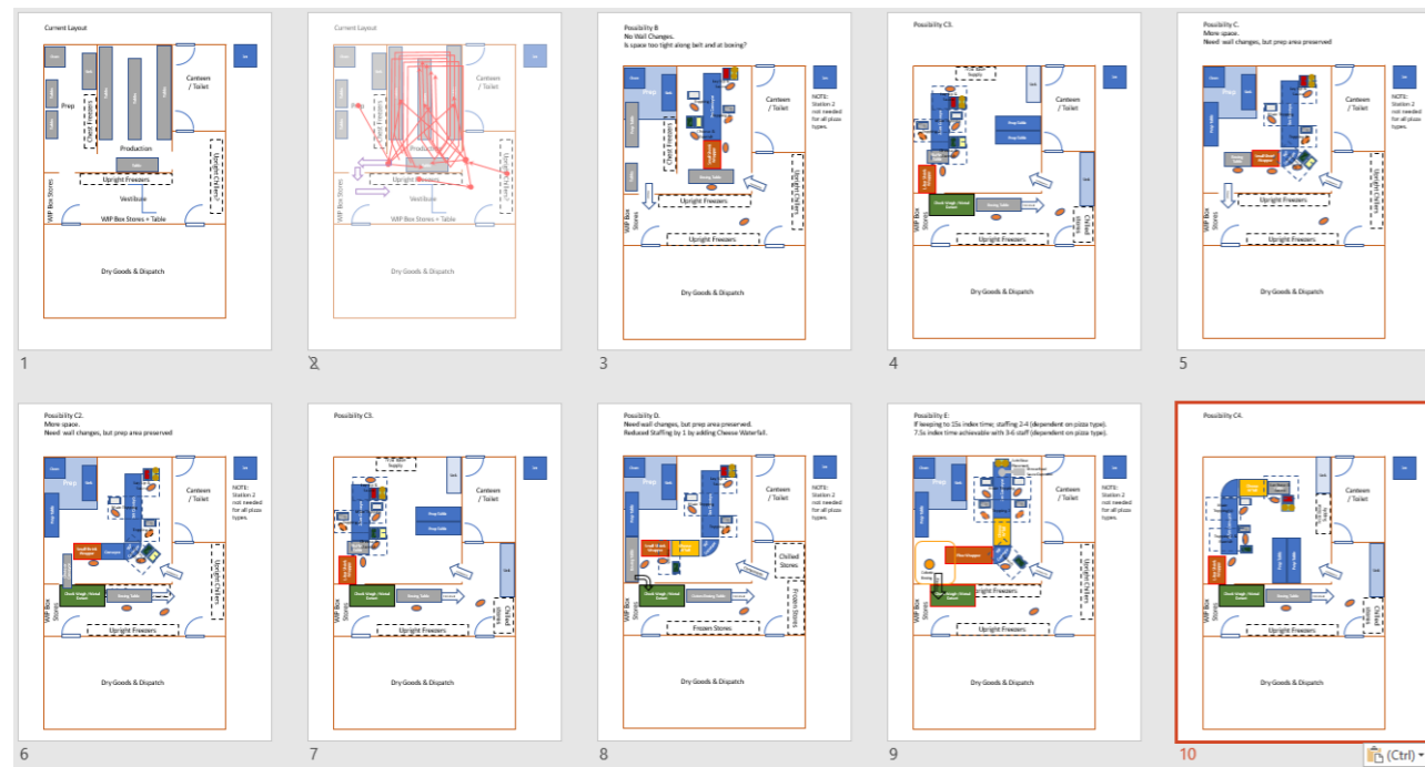
Figure 2: Layout Options

associated projected cost-benefit (Figure 3). These proposals were discussed and honed with One Planet Pizza and a priority sequence agreed. This formed the basis for the sequenced automation roadmap.