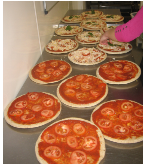
Figure 1: Manual sequential pizza topping process

The COTEMACO support has assessed the current production processes and provided an automation roadmap to support the growth of the enterprise.