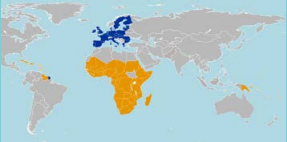
Figure 1. The EU (in blue) and the African, Caribbean & Pacific (ACP) Group of States (in yellow)