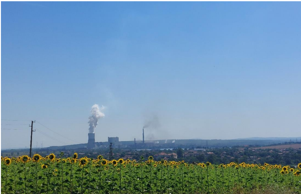
Photo: Thermal power plant in Galabovo

See our most recent briefings on just transition: