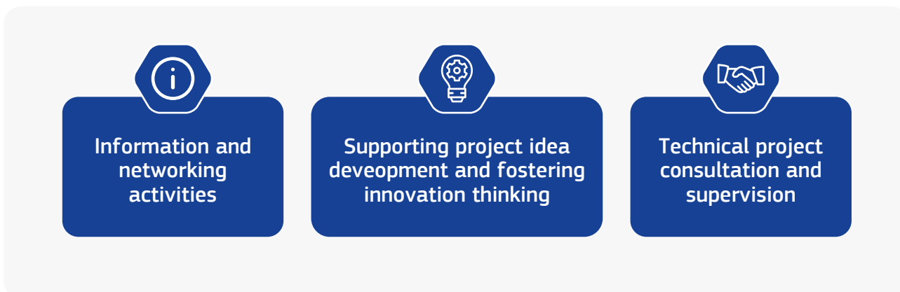
FIGURE 1: MAIN TASKS TAKEN ON BY THE STRUCTURAL PILOTS.