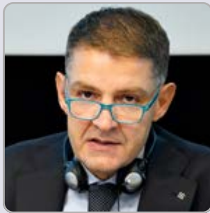
CoR rapporteur Giorgio Magliocca

In 2023, the CoR adopted its first stand-alone opinion on strategic foresight as an instrument of EU governance and better regulation . The spokesperson for the CoR on this topic is Giorgio Magliocca, president of the Caserta province in Italy. The document stresses the added value of strategic foresight for local and regional authorities.