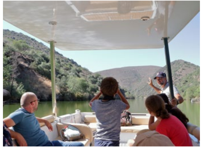
Pic 2: A Côa Ambassador leads tourists on a boat tour in the Côa Valley.

The programme was designed to train the ambassadors by promoting local heritage and gastronomy. Given the local geography, we had some difficulty in bringing together the people involved, but during the sessions it was gratifying to see the participants buying into the role.