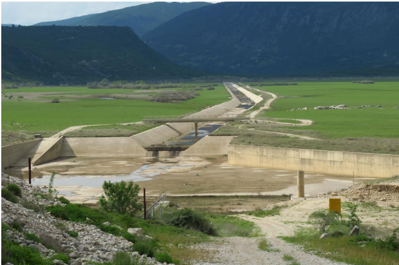
The channel through Fatničko polje. Photo: CEE Bankwatch Network, June 2023.

A large channel through Fatničko polje has also been built 60 by Integral Inženjering.