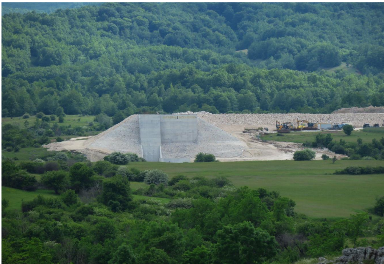
The entrance to the tunnel at Nevesinjsko polje in the Zalomka river valley. Photo: CEE Bankwatch Network, June 2023.

tunnel. 63 By February 2023, 11.8 kilometres of tunnel had been excavated, with only 300 metres left to go, 64 and at the beginning of November 2023 it was reported that 140 metres was left to go. 65