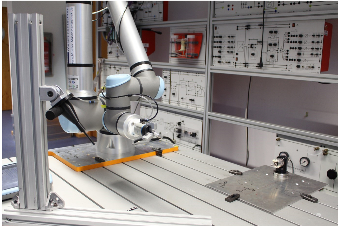
Figure 1: first test of different handling principles